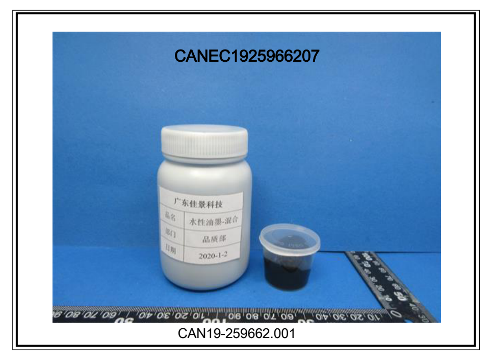
SGS authenticate the photo on original report only